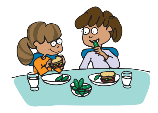
* Be sure to follow local safety and sanitation regulations.